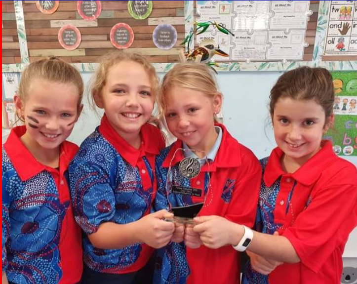
WIRADJURI CHOIR MEMBERS WITH FORBES EISTEDDFOD TROPHY