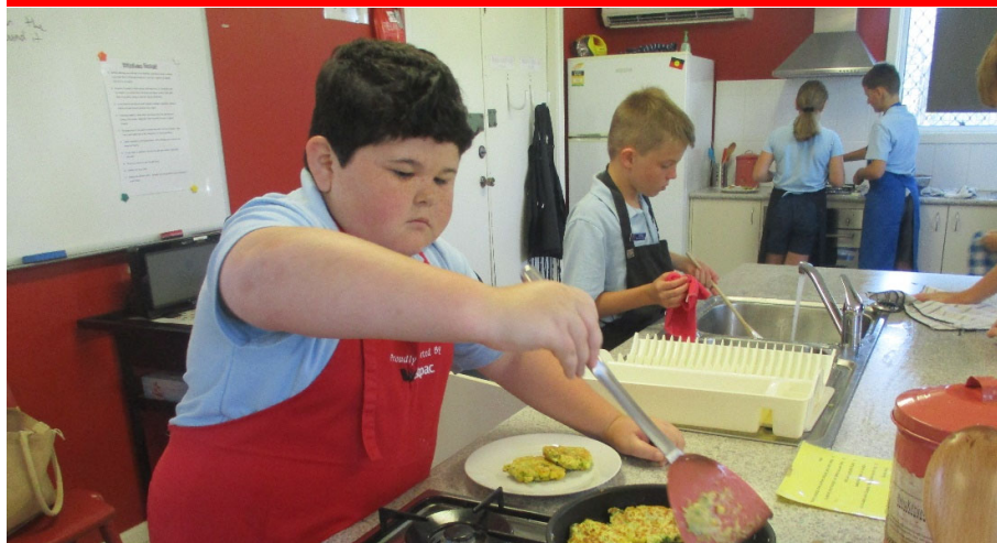
5/6Y making zucchini fritters in Kitchen lessons