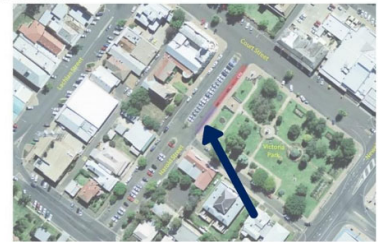
Forbes COVID-19 drive thru tests At Harold Street with entry via Court Street