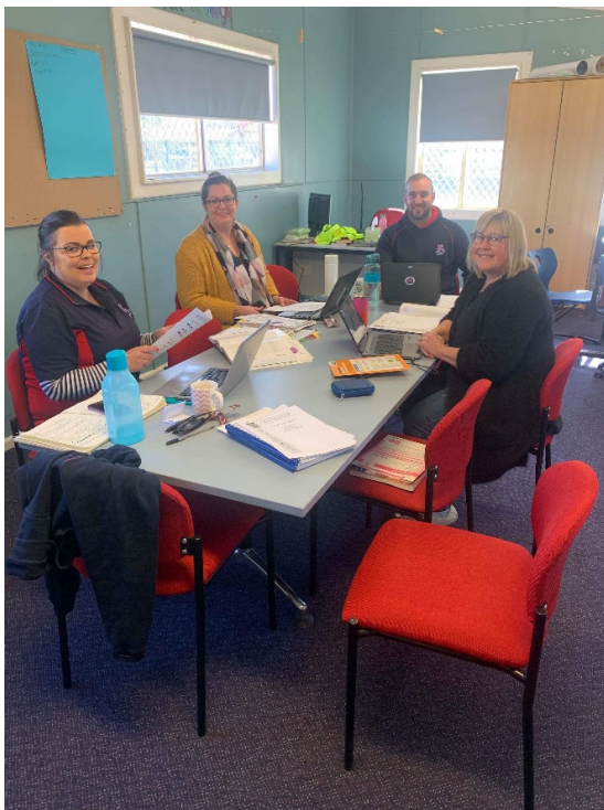
Stage 3 teachers working together

Stage 3 students for increasing their results in the addition and subtraction assessment by 20%.