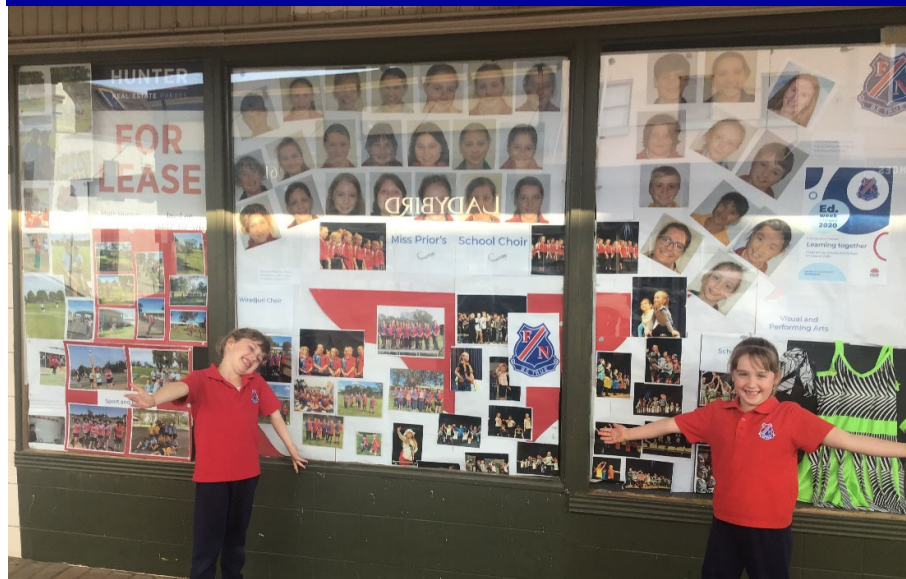
FNPS display in Templar St shopfront