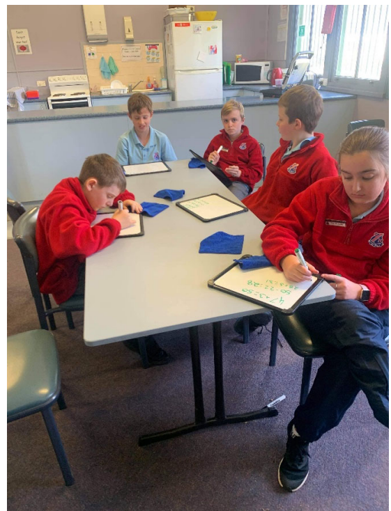
5/6P students participating in a literacy sprint