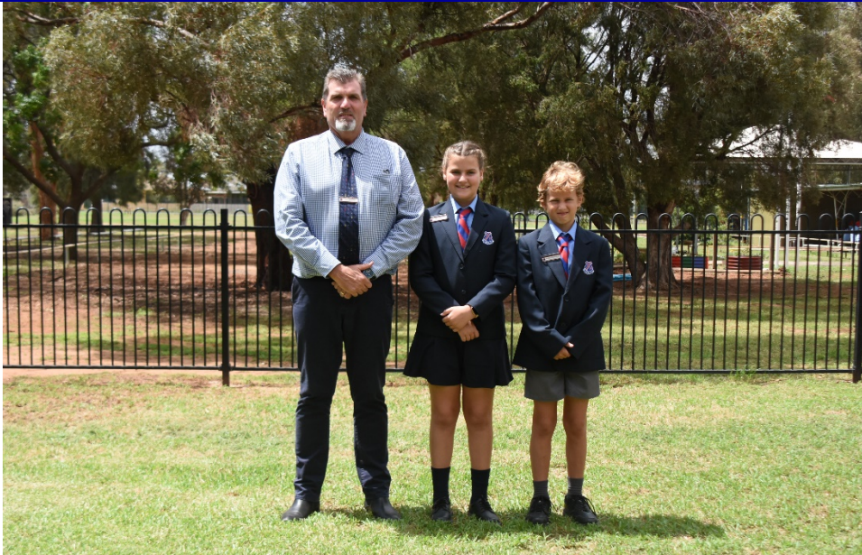
Principal with School Captains