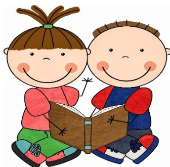
Aboriginal Families as Teachers Program